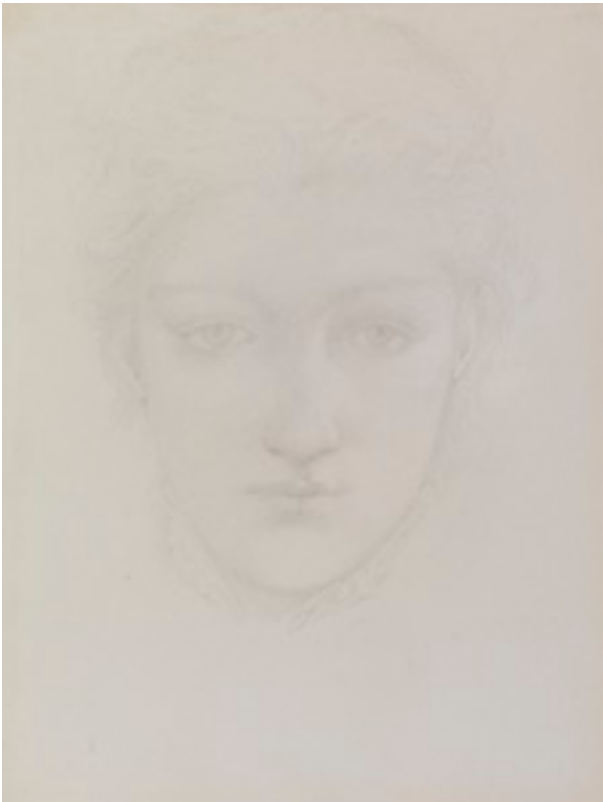
17257 Sir Edward Coley Burne-Jones Bt., ARA 1833-1898

Plaster relief, coloured and gilt; signed and dated Dec [18] 98 23 1/2 x 13in / 59.7 x 33cm