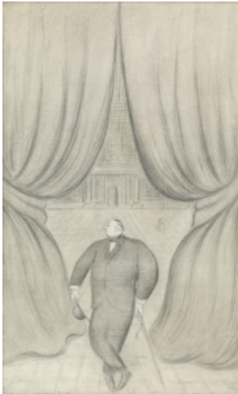
13664 Sir Max Beerbohm 1872-1956

Framed dimensions: 47 x 60cm 9.75 x 15 inches